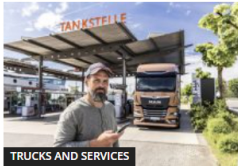
TRUCKS AND SERVICES MAN and UTA Edenred jointly develop MAN SimplePay