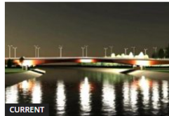
CURRENT Contract signed for the set of bridges over the Prut, in Ungheni