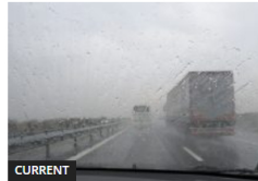
CURRENT Torrential rain and gale warning