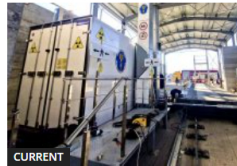
CURRENT Scanner for trucks, at PTF Siret