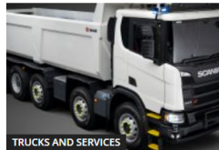
TRUCKS AND SERVICES Scania autonomous truck for the mining industry