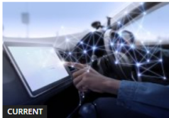
CURRENT US wants to ban foreign connected cars