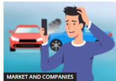
MARKET AND COMPANIES Tourists received compensation of 160 million lei in the last 5 years (UNSA)